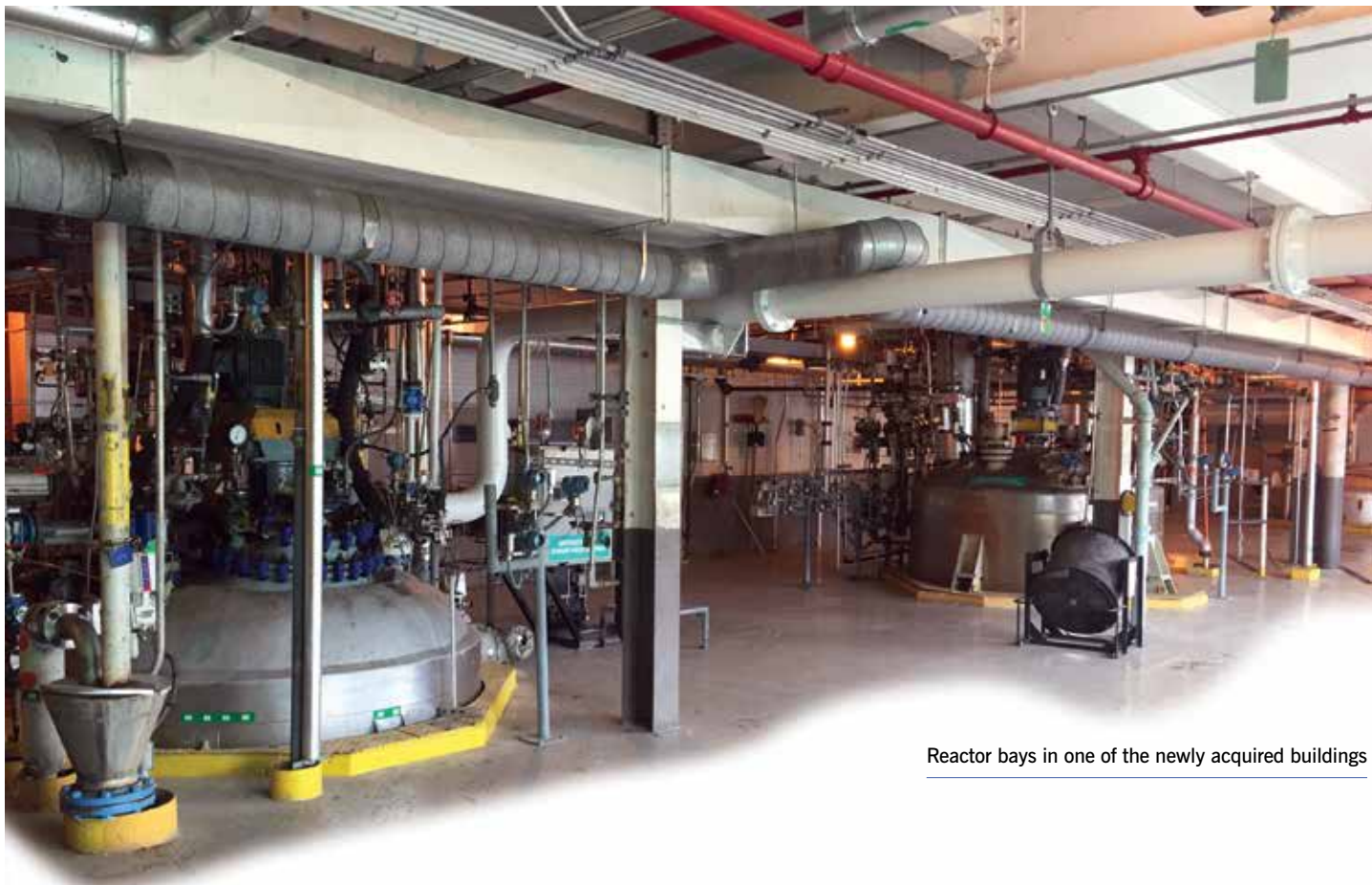
Reactor bays in one of the newly acquired buildings